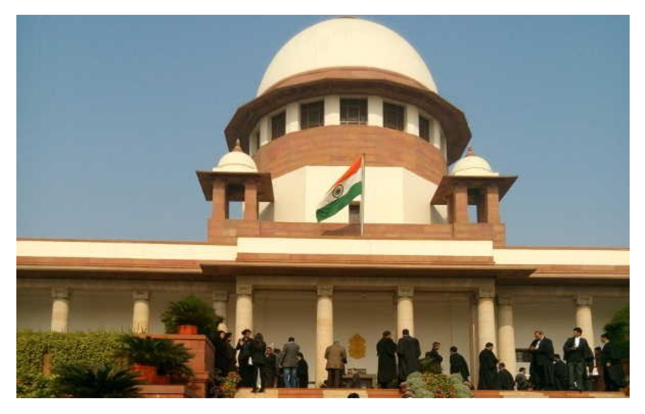
Part V SUPREME COURT OF INDIA

The Supreme Court is the highest judicial authority /court of India which was inaugurated on January 28<sup>th</sup> 1950 . Article 124 to 147 in Part V of Constitution deal with Supreme Court. It is at the apex of the Indian judicial system. In the previous two lessons, you have learnt that the Union legislature, which is known as Parliament, makes laws for the whole country in respect of the Union and the Concurrent Lists and the executive comprising the President, Council of Ministers and bureaucracy enforces law . Judiciary, the third organ of the government, has an equally important role to play. It settles the disputes, interprets laws , protects fundamental rights and acts as guardian of the Constitution.